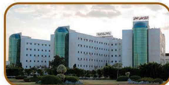
INTERNATIONAL MEDICAL CENTER