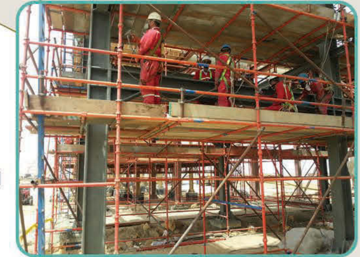
Painting - Zohr Project during application

Egypt Gas is one of the first participants in Zohr project, and is solely responsible for the application of Fire Proofing material on the steel structures in Zohr. As Egypt Gas Exclusively owns both dual and single pumps necessary for fire proofing material Application.