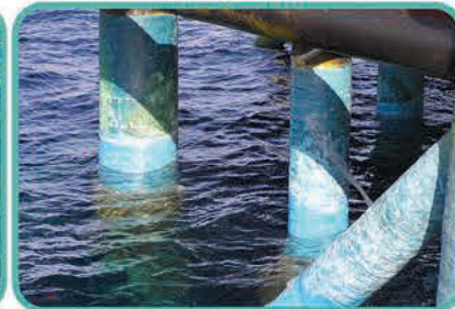
Splash Zone Coating

Egypt Gas Also specialized in the application of Epoxy Intumescent Coatings (Chartek-VII & Pitt-Char XP, Jotachar JF750), using Single & Dual Airless Spray Pumps to provide superior Fire and Corrosion Protection under hydrocarbon and jet fire conditions.