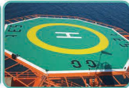
Painting - Helideck