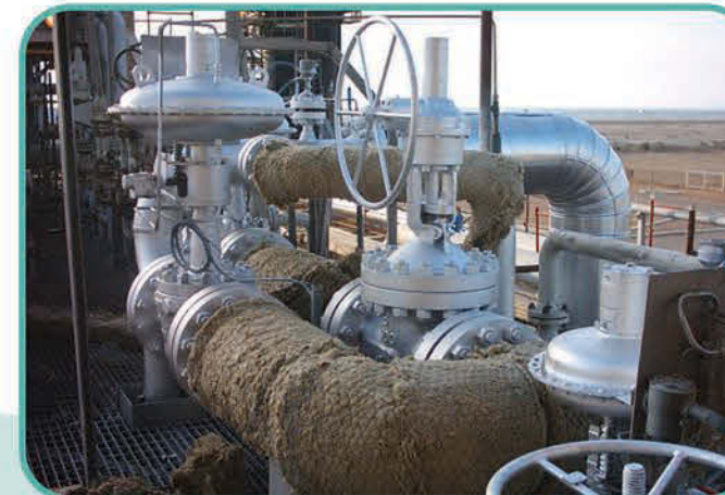
Insulation Work in Rosetta Field - Rashpetco

Egypt Gas performed more than 111,000 m2 of Thermal Insulation works, using Aluminum/ Stainless Steel cladding Polyurethane Injection/Isocam/Rockwool for Cold /Hot Insulation.