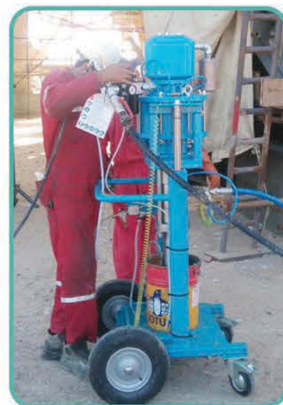
Single Airless Spray Pump

Egypt Gas Also specialized in the application of Epoxy Intumescent Coatings (Chartek-VII & Pitt-Char XP, Jotachar JF750), using Single & Dual Airless Spray Pumps to provide superior Fire and Corrosion Protection under hydrocarbon and jet fire conditions.