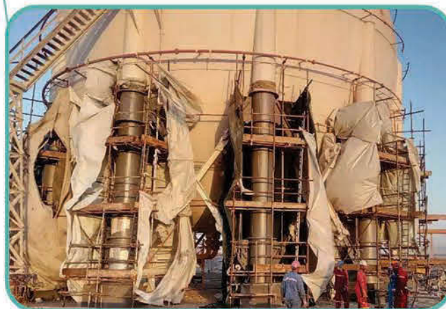
Fire Proofing Works at SUCO - Zeit Bay