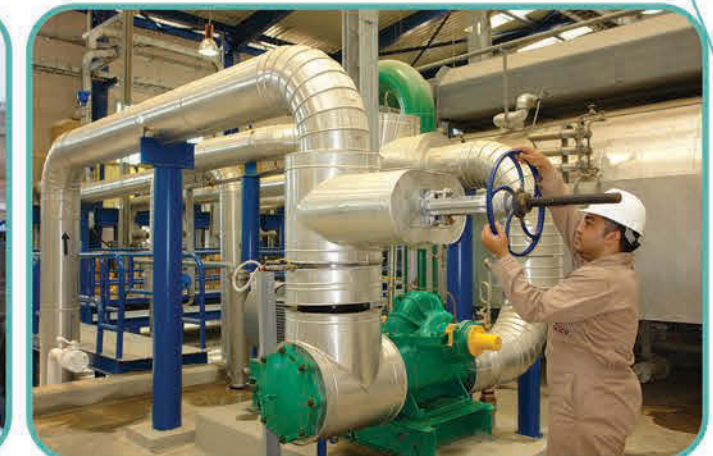
Insulation Work in Smart Village - Gasco