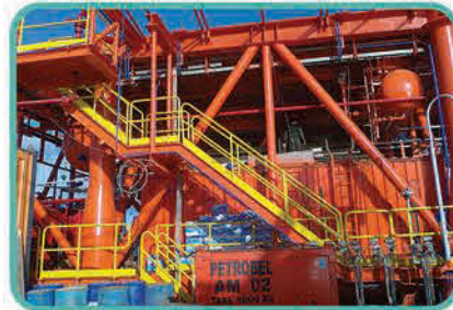
Painting - Platform

All Painting activities are conducted using highly qualified crews, under the supervision of internationally certified Inspectors.